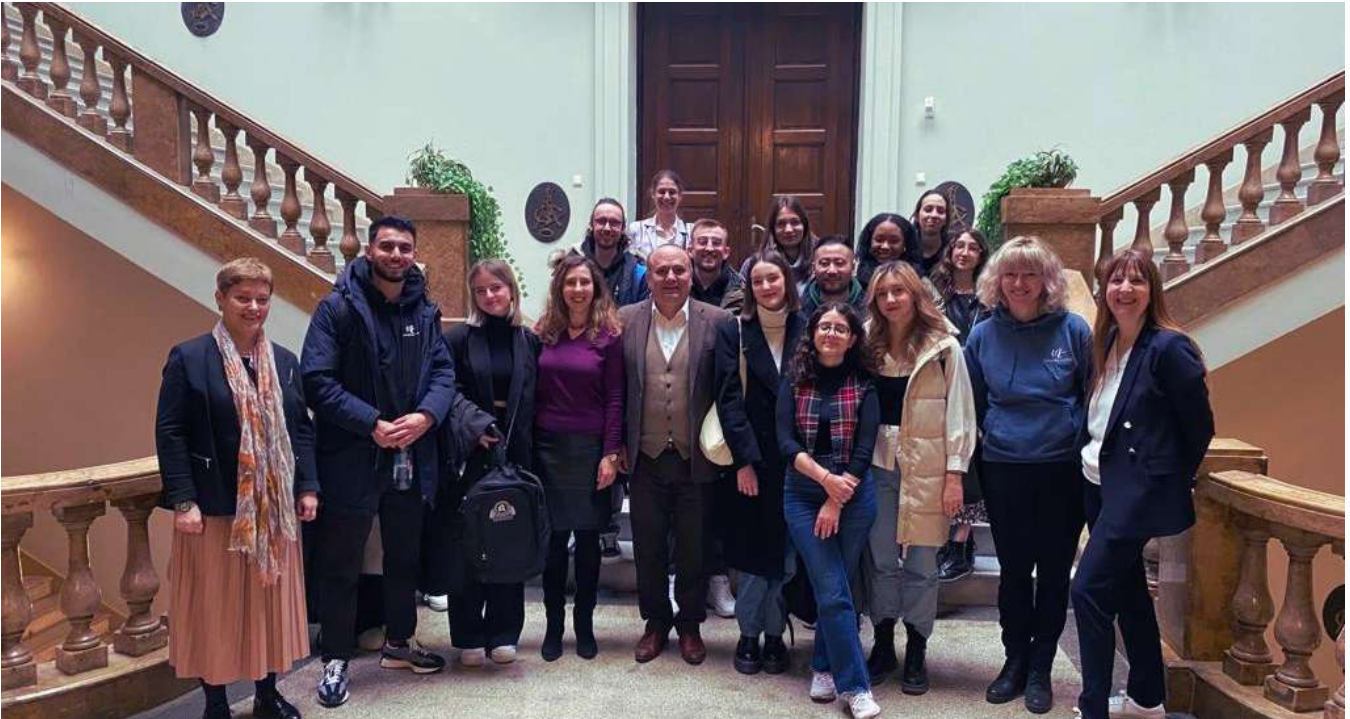
PHOTO: Welcoming in March 2023 a delegation of students and professors from our partner, the University of Artois, from France within our double degree agreement for bachelor studies with the Faculty of International Business and Economics, Applied Modern Languages.