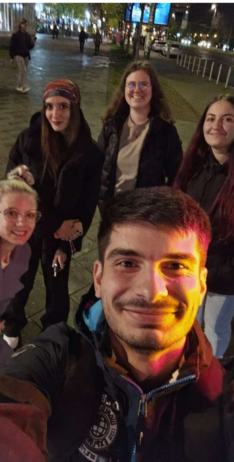
PHOTO: Students from the Bucharest University of Economic Studies participate in April 2023 in the Berlin hybrid mobility organized by ESCP Berlin campus in Erasmus+ Project FOReSiGHT 2020-1-RO01-KA203-080368 (ASE consortium lead)