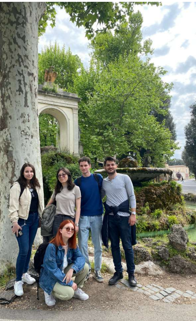
PHOTO: Students from the Bucharest University of Economic Studies participate in April 2023 in the Rome hybrid mobility organized by Sapienza University of Rome n Erasmus+ Project FOrSiGHT 2020-1-RO01-KA203-080368 (ASE consortium lead)