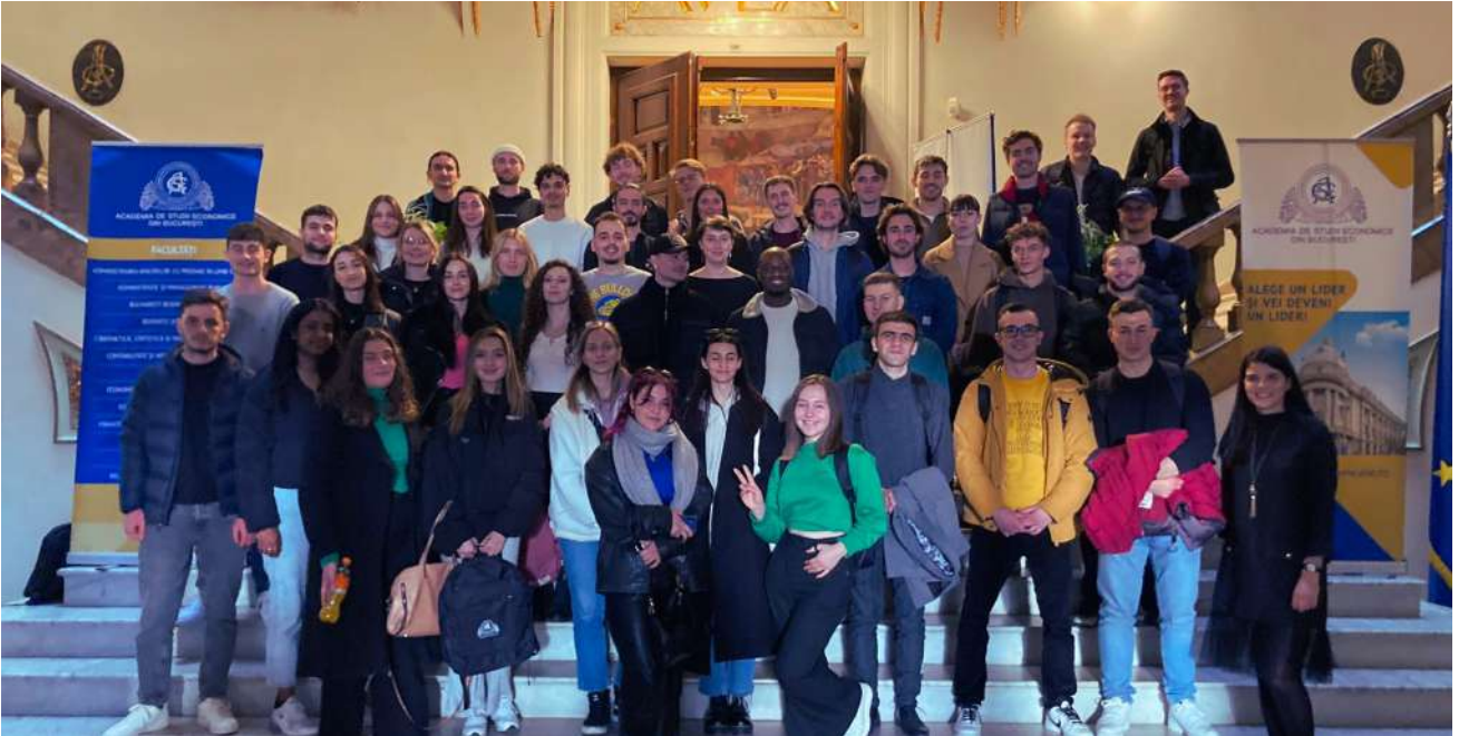
PHOTO: Welcome Day in February 2023 for our incoming Erasmus+ students studying at ASE in the spring semester

Workshop on cultural adaptation for international students